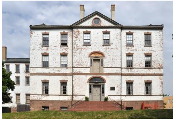
Proprietary House, Perth Amboy, official residence for NJ's Royal Governor, 1764-1776

Lesson Creator: New Jersey Center for Civic Education, Rutgers University, Piscataway, NJ